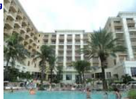
The Sand Pearl Resort Clearwater Beach Florida

With continued success, GPS Ontario continues to grow and evolve into the bigger better and stronger precision agriculture supplier. GPS Ontario has been invited to attend the Trimble Reseller Mid Summers Meeting to discuss. New Products, New strategies and upcoming software and hardware updates. With all of these continued seminars and training session the next few weeks will be as always extremely exciting in the realm of GPS Ontario