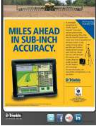
GPS Ontario New Site Layout