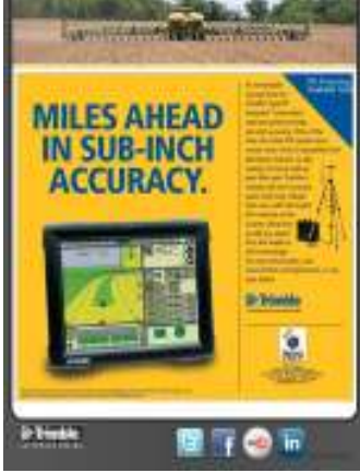
GPS Ontario New Site Layout