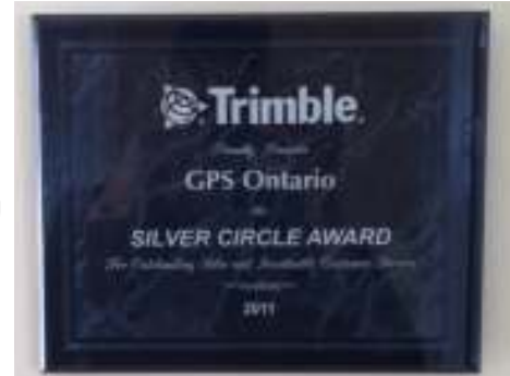
GPS Ontario Silver Circle Award

The Team at GPS Ontario would like to extend a sincere appreciation to everyone who supported us in 2011. As a result of your continued support, GPS Ontario was recognized by Trimble Navigation Limited with the Silver Circle Award for " Outstanding Sales and Invaluable Customer Service " for 2011. With ongoing improvements to GPS Ontario we will continue to expand and grow along with your operations. 2012 is promising to be a great year with new products and improvements to the current solutions we offer. There are many updates for the 2012 season which we will forward to you as soon as they become available.